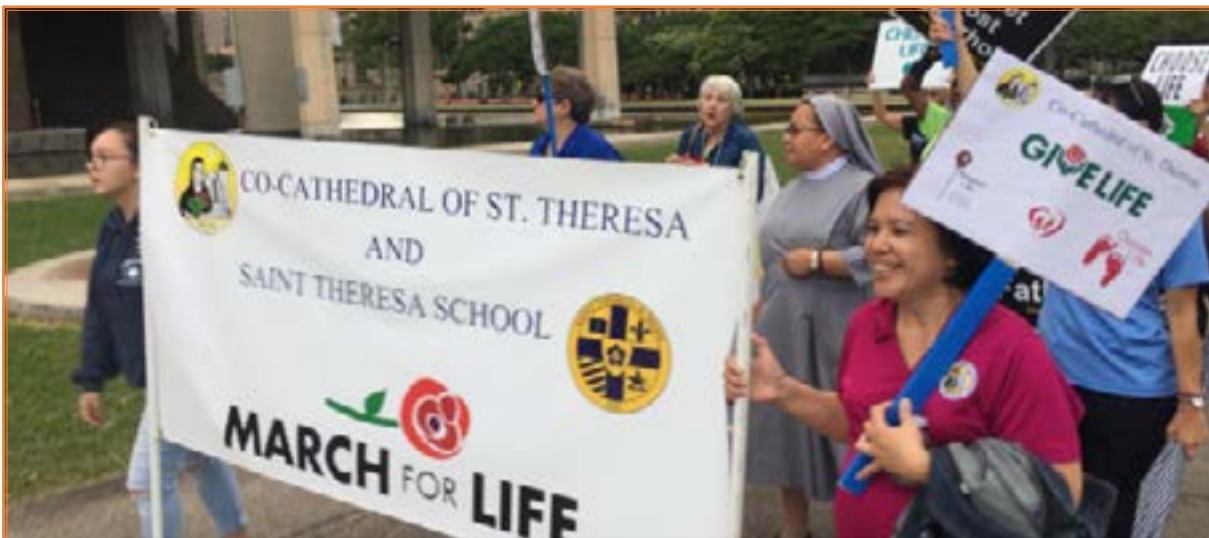
RALLYING FOR LIFE AT MARCH FOR LIFE ON FRIDAY, JAN 20 AT HAWAII STATE CAPITOL

In today's Gospel, Jesus begins his Sermon on the Mount with a series of blessings, the Beatitudes. The Beatitudes are a summary of the fundamental attitude of a Christian steward.