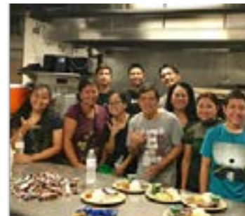
"Faith in action is love and love in action is service." ~St. Teresa of Calcutta