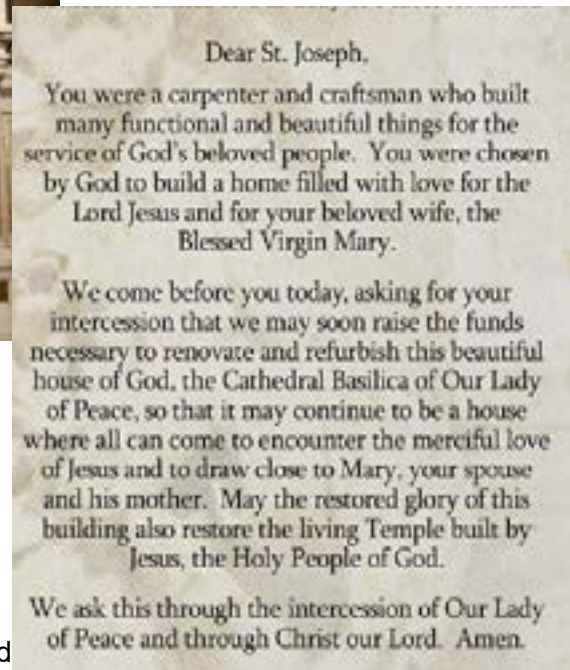
Back of card

Prayer to St. Joseph Available at the Cathedral Basilica of Our Lady of Peace